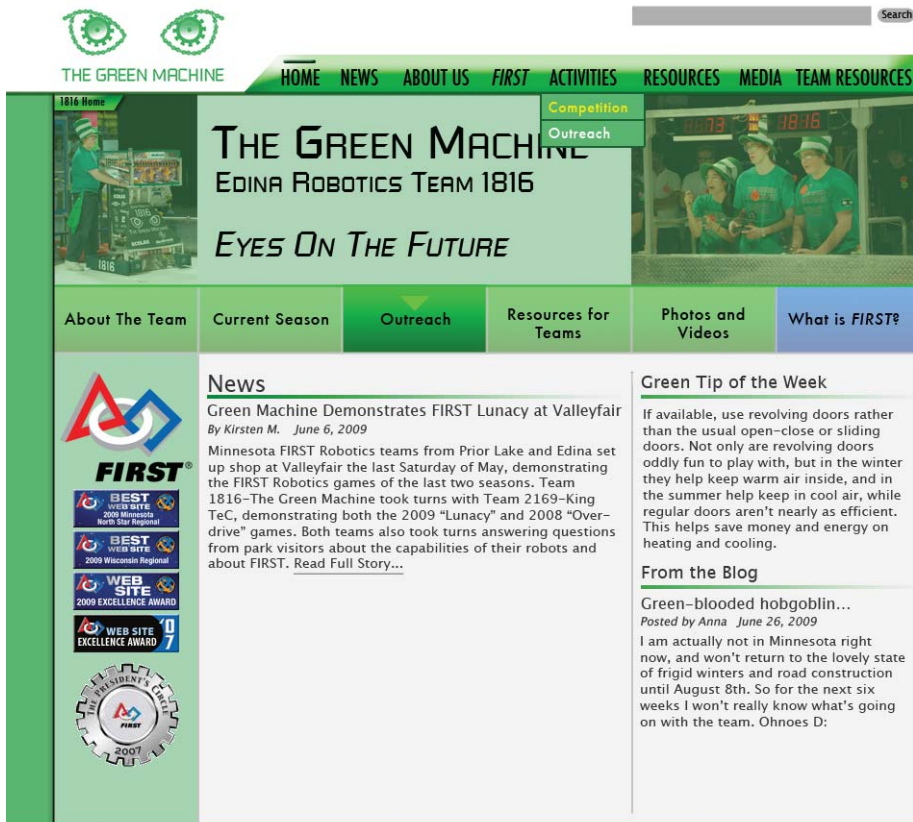
Edina Robotics - Home Page Version 3 Minor tweaks in this version. More space between banners on the right was added and the navigation bar's spacing was adjusted.